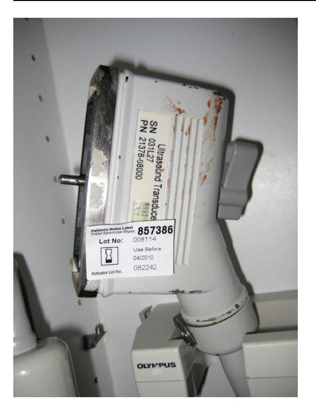
Figure 2. Any part of the TOE probe can be a source of contamination.

All TOE probes, irrespective of the manufacturer, share the same components (see Glossary and Figure 1): a flexible tip, a shaft, a probe handle with steering controls and a cable which attaches to the plug socket in its associated equipment ( Figure 1 ). Handling of any part of this apparatus results in a potential source of infection ( Figure 2 – these were probes considered to have been decontaminated by a manual wipe system and were ready for re-use with a subsequent patient). During passage into a patient, there is contact with intact mucous membranes and the potential for contact with non-intact mucous membranes. This means that TOE probes require disinfection to a similar level as upper GIE<sup>3</sup>.